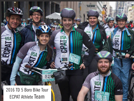
2016 TD 5 Boro Bike Tour ECPAT Athlete Team